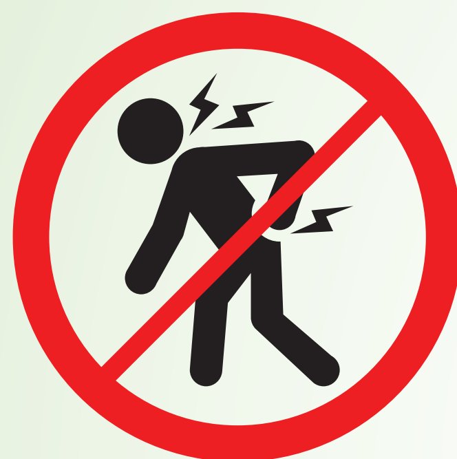
Neck, Back or Bone Ailment