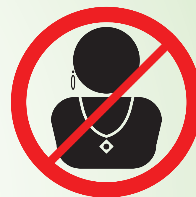
Loose Fitting Jewelry