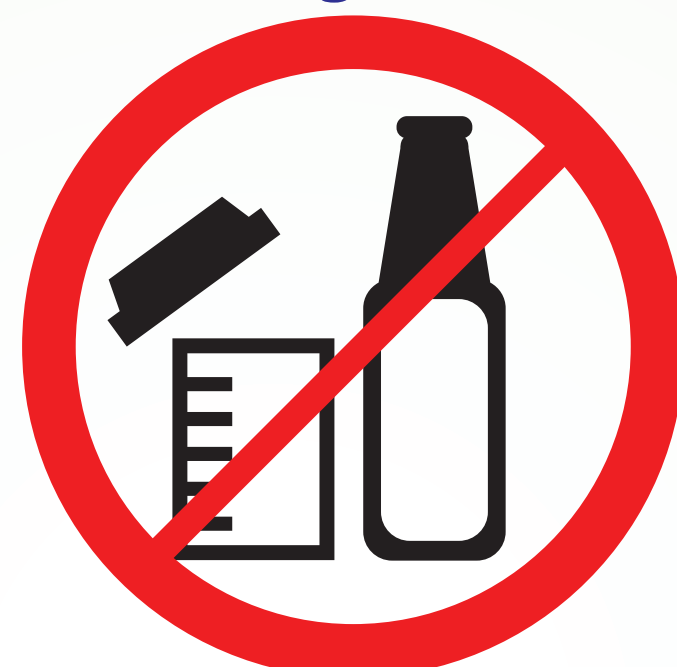
Under Influence of Drugs or Alcohol