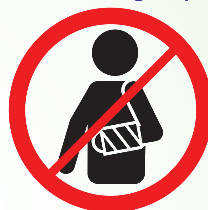
Recent Injury or Wearing Hard Cast